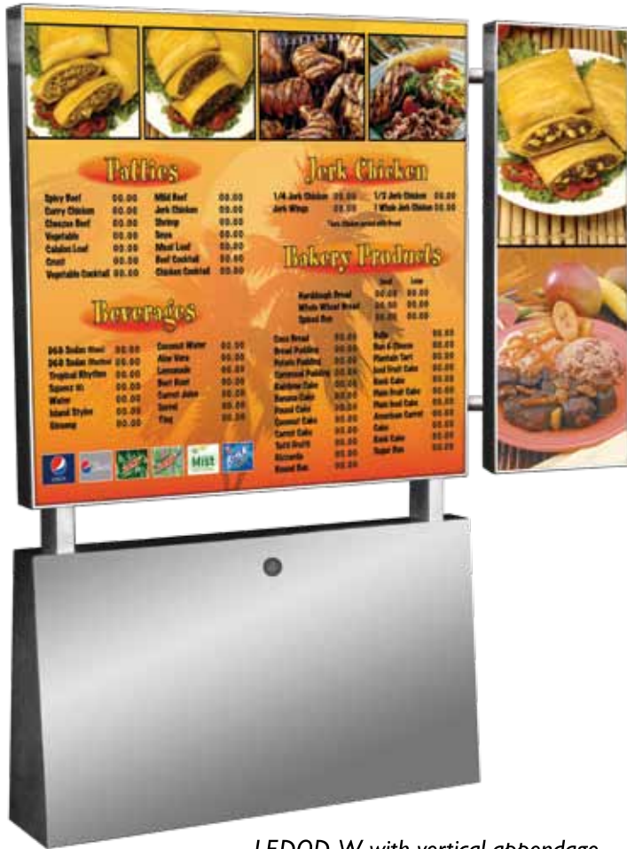
LEDOD-W with vertical appendage.

toll free 800.321.8105 • www.pepsipop.com (password: impactpop) • fax 775.882.5210