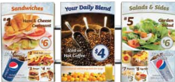
LEDOD-3 Choose from one, two, or three large panels