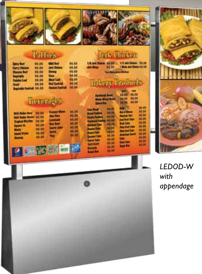
LEDOD-W with appendage

LEDOD-3 - If you do not see the color you want, just call – many custom colors are available! Powder-coated machined aluminum frame.