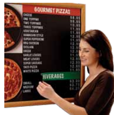
Our boards use magnetic strips for easy menu changes.