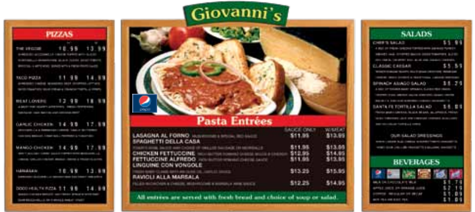
Gallery board sizes GS3022M (larger board) and GS1622M (smaller panel) shown above.