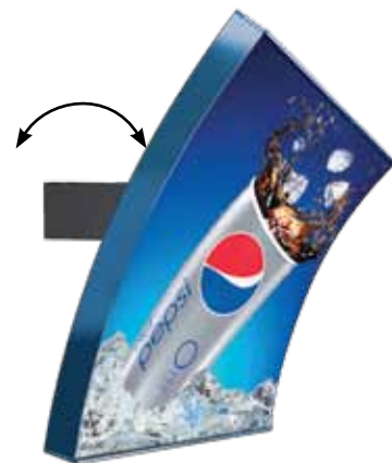
Adjustable viewing angle good for high displays.