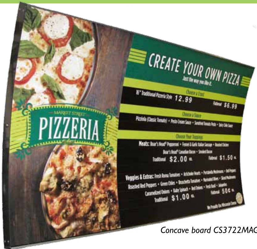
Concave board CS3722MAG