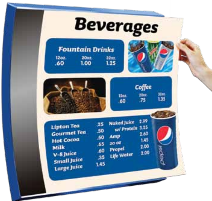
Quickly and easily change out graphics by sliding in a new graphic. Board number CS2322FLEX.