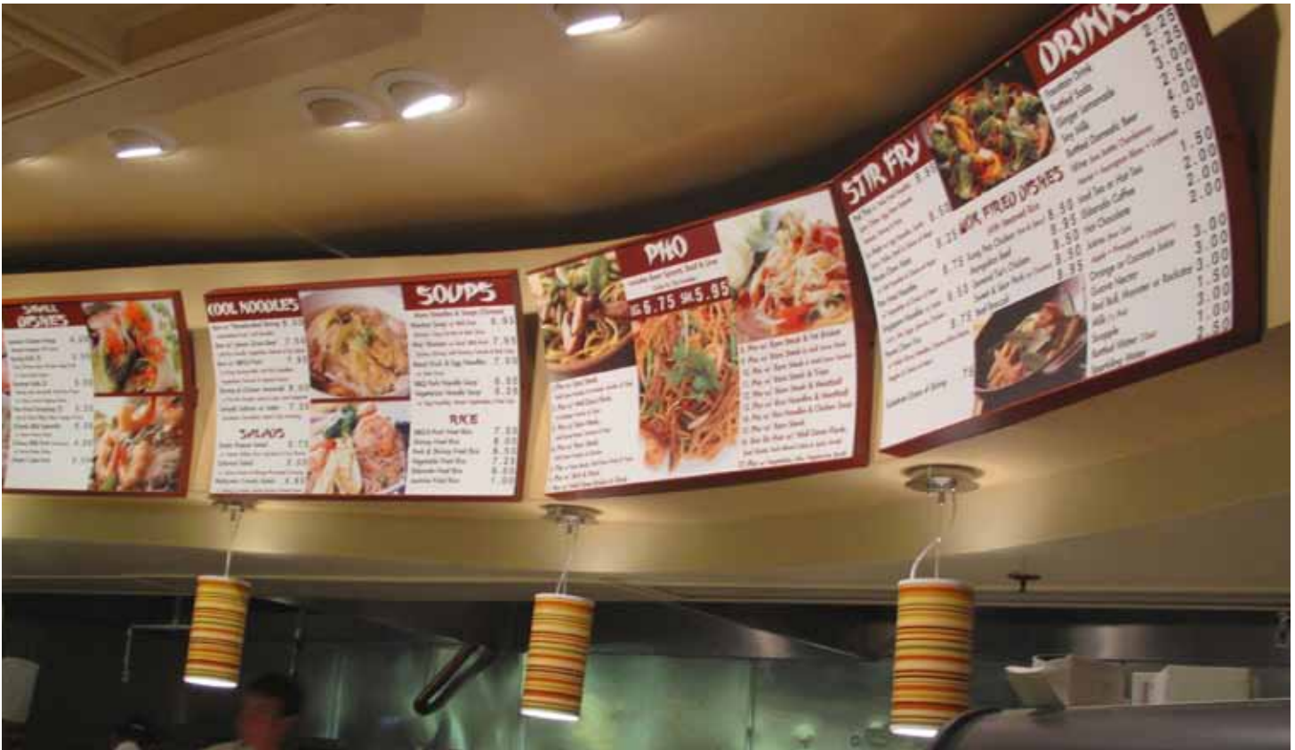
Four board CS3722MAG menu at the Eldorado Casino in Reno, Nevada. Magnetic option shown. Machined aluminum frame with baked on powder-coated finish.