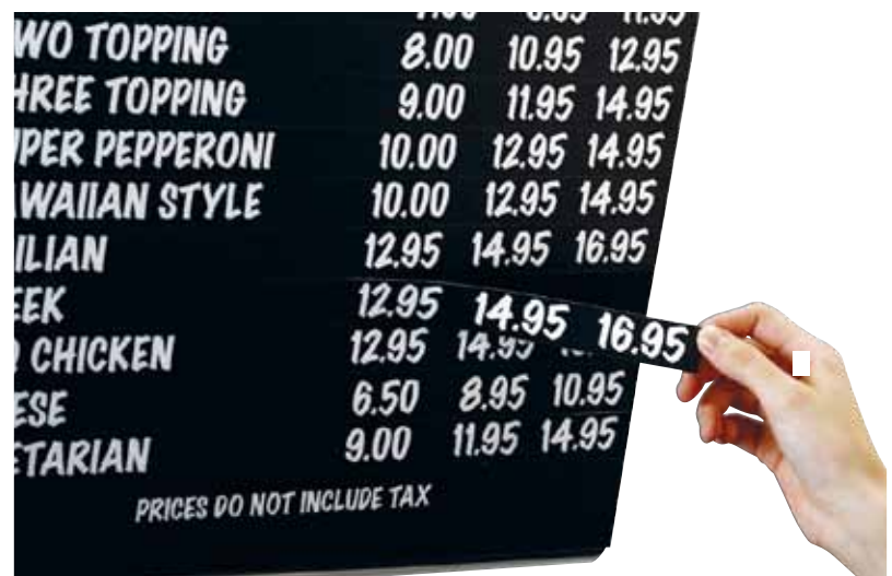
Our boards use magnetic strips for easy menu changes.