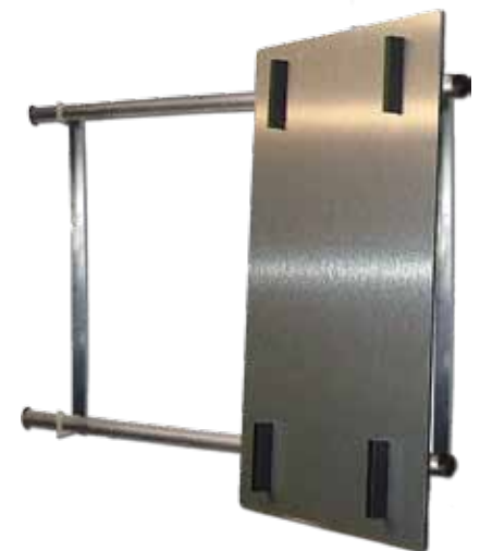
The pole mount system is easy to install and is simple to expand to a larger size.