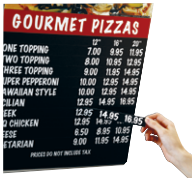
Magnetic strips allow you to change menu items and pricing.