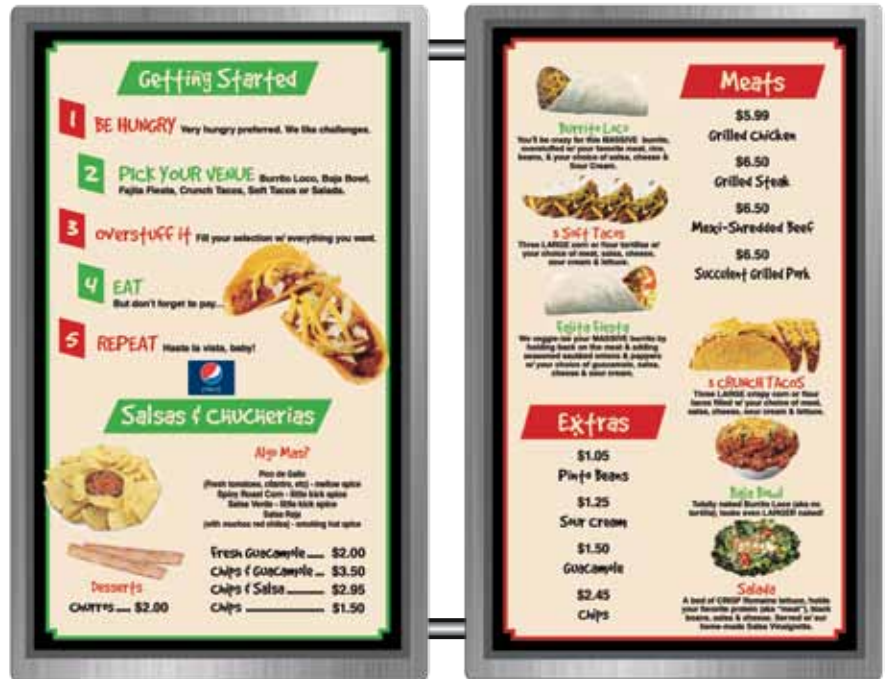
BM37F in Brushed Stainless