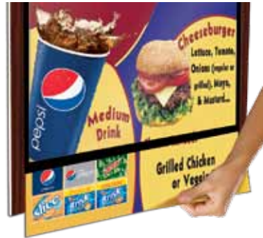
To change graphics, lift the lens cover and slide in a new graphic. The lens cover is durable and easy to clean.