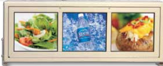
CLA-03H Illuminated, three panel 54-1/4" W x 21-3/4" H x 6" D Utilizes 12-line holders or three graphics sized: 16-3/16" W x 16-1/16" H