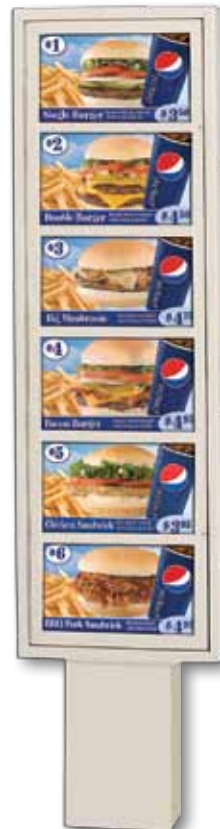
CLP-06 - Classic six-panel - 20-5/8"W x 88-7/8"H Utilizes 7-line holders or six 16-3/16"W x 9-3/8"H graphics