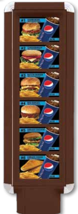
DSP-06 - Designer six-panel - 29-1/8"W x 94-3/4"H - Utilizes 7-line holders or six 16-3/16"W x 9-3/8"H graphics