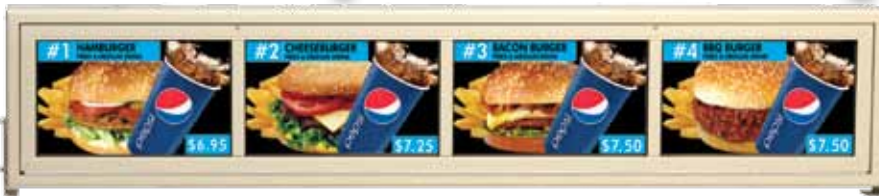
CLA-04H Illuminated four panel 71-3/4" W x 14-1/4" H x 6" D Utilizes 7-line holders or four 16-3/16" W x 9-3/4" H sized graphics.