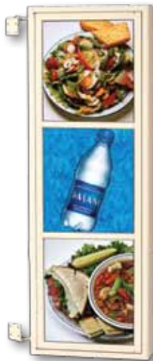
CLA-03V Illuminated three panel 20-3/4" W x 54-3/4" H x 6" D Utilizes 12-line holders or three graphics sized 16-3/16" W x 16-1/16" H