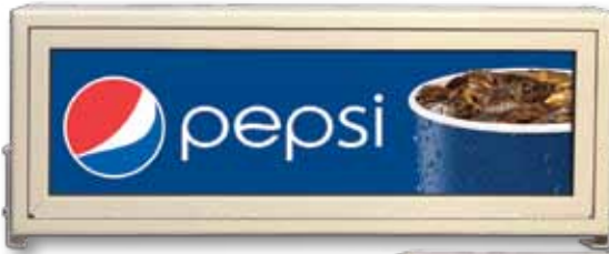
CLA-01H Illuminated, one panel 54-1/2" W x 21-3/4" H x 6" D Holds one graphic size: 50-1/8" W x 16-3/16" H

toll free 800.321.8105 • www.pepsipop.com (password: impactpop) • fax 775.882.5210