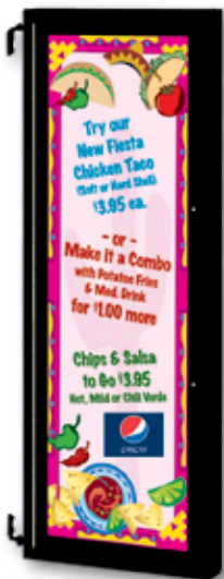
CLA-01V Illuminated one panel 20-3/4" W x 54-3/4" H x 6" D Holds one graphic sized 16-1/16" W x 49-13/16" H