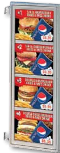
CLA-04NV Non-illuminated four panel 20-5/8" W x 44-1/2" H x 1-1/2" D Utilizes seven line holders or four graphics sized 16-3/16" W x 9-3/4" H