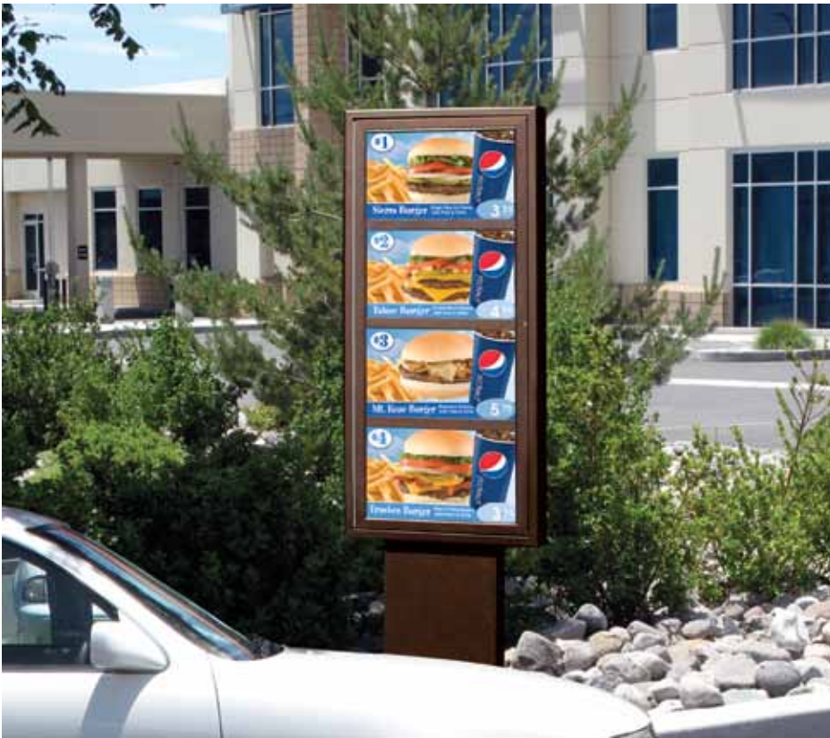
CLOD-04 pre-sell board in canyon dust. Durable extruded aluminum frame with baked on powder coated finish.

toll free 800.321.8105 • www.pepsipop.com (password: impactpop) • fax 775.882.5210