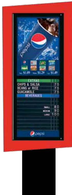
DMOD-02 W Wave 26"W x 54-1/2" H Utilizes 7 or 16 line holders or two 16 3/16"W x 11-3/4" H graphics