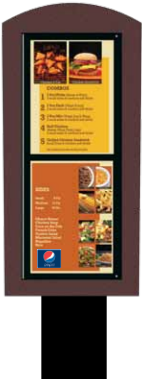
DMOD-02 S Single Arc 26" W x 54-1/2" H Utilizes 7 or 16 line holders or two 16-3/16"W x 11-3/4" H graphics