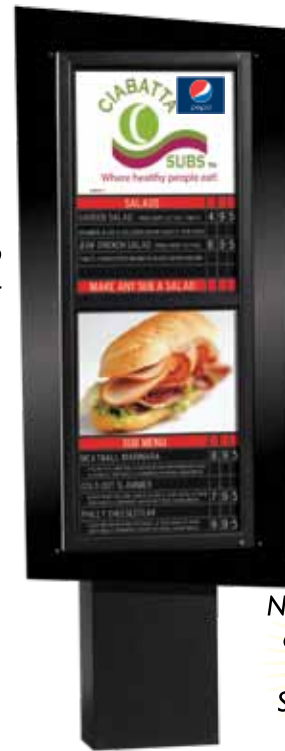
DMOD-02 T -Tilt 26"W x 54-1/2" H Utilizes 7 or 16 line holders or two 16-3/16" W x 11-3/4" H graphics

Now, your choice of fonts, colors and graphics on wordstrips! See page 42 for details.