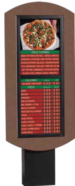
DMOD-02 D - Double Arc 27"W x 56-1/2" H Utilizes 7 or 16 line holders or two 16-3/16"W x 11-3/4" H graphics