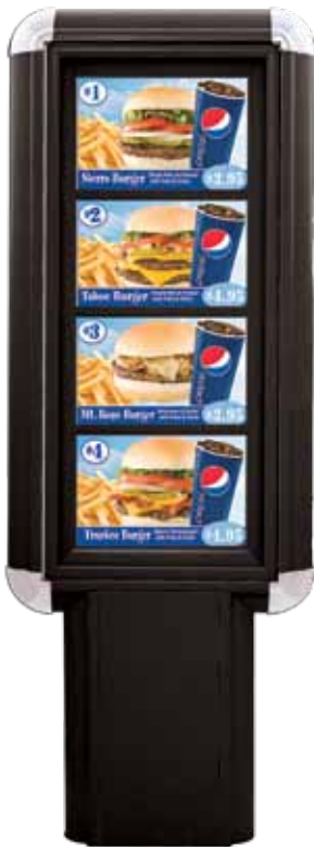
DSP-04 - Designer four-panel, 29-1/8"W x 74"H Utilizes 7-line holders or four, 16- 3/16"W x 9-3/8"H graphics

Also available in Wall Mount (not shown).