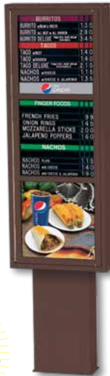
CLP-03SP - Classic three-panel 20-3/4"W x 77-1/4"H Utilizes 12-line holders or three 16-3/16"W x 16- 1/16"H graphics