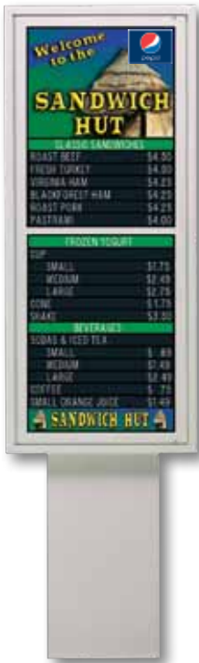
CLP-02 - Classic two-panel 20-5/8"W x 71"H - Utilizes 16-line holders or two 16-3/16"W x 21-3/8"H graphics

toll free 800.321.8105 • www.pepsipop.com (password: impactpop) • fax 775.882.5210