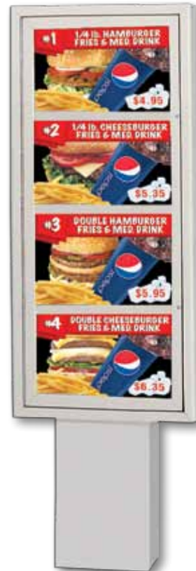
CLP-04 - Classic four-panel 20-5/8"W x 67-3/4"H Utilizes 7-line holders or four 16-3/16"W x 9-3/8"H graphics

Also available in Wall Mount (not shown).