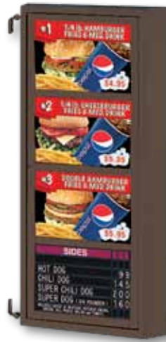
CLA-04V Illuminated four panel 20-7/8" W x 45-1/4" H x 6" D Utilizes seven line holders or four graphics sized 16-3/16" W x 9-3/4" H